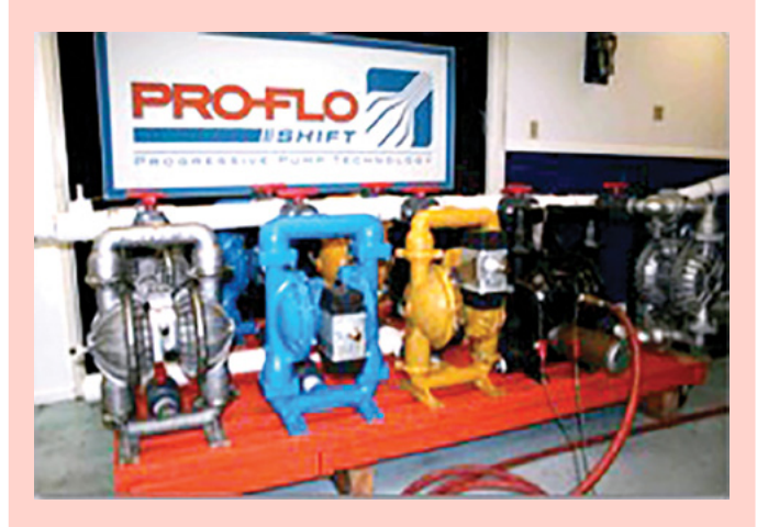
In a carefully conducted laboratory test observed by pump experts and industrial professionals, the leading Air Operated Double Diaphragm Pump (AODDP) technologies were compared against the Wilden<sup>®</sup> Pro-Flo<sup>®</sup> SHIFT.

Because the Pro-Flo SHIFT does not require an additional electronically controlled ADS or a "learning period" before it can begin operating at its highest efficiency, it can be configured as ATEX-compliant right out of the box, it is submersible and it offers an annual cost savings over the closest competitor of $1,135 per pump. More productivity, less energy, reduced air consumption and a rapid ROI per pump means immediate cost savings and better long-term bottom-line results.