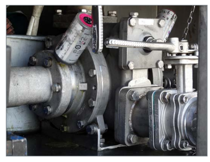
Blackmer® STX Series Sliding Vane Pumps feature a 316 stainless-steel body and internals with chemical-resistant seals, bearings and 0-rings, all of which make it an ideal solution when transferring corrosive liquids like hydrogen peroxide.

Kees in't Veen had been using different models of Blackmer pumps in various capacities since 1987, but handling H_2O_2 required a pump technology that could meet its unique material characteristics, mainly that it is corrosive and can emit irritating – even dangerous – vapors if mishandled. The solution was found in the STX Series Sliding Vane Pump from Blackmer, specifically the 80mm models.