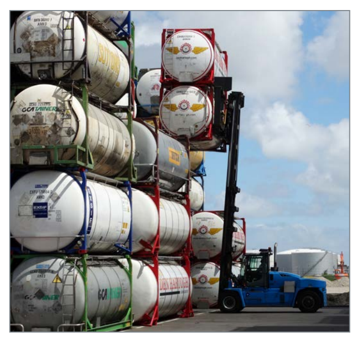
The ITT Transport Service Centre at Europoort Rotterdam is constantly full of activity, and pump and compressor technologies from Blackmer<sup>®</sup> play a prominent role in ensuring that all of the site's various businesses operate smoothly, safely and reliably.

"We have gas trailers that are dedicated for gas transport and all are outfitted with Blackmer LGL pumps," said in't Veen. "These trailers need to be unloaded below 100 kilograms (220 pounds) to be considered empty and the LGL pumps do a great job. That is fantastic equipment. They save our clients a lot of money and time by emptying the trailers to acceptable levels."