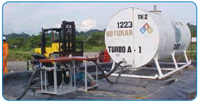
Blackmer sliding vane pumps found in the Peruvian jungle.

Pumping fuel from a river barge is difficult because it involves a volatile product that is constantly in motion due to the rise and fall of the river tides. The operation requires pumps that can deliver high suction lift and discharge pressures, work with low available NPSH (high vapor pressures), have self-priming capabilities and can operate in hot, humid temperatures that can exceed 32°C (90°F).