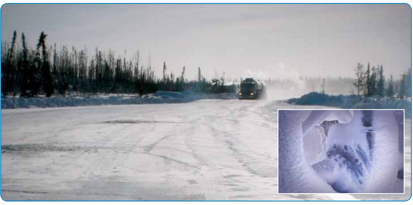
Blackmer sliding vane transport pumps (see insert) have been braving the cold on Northern Canada's ice roads for more than 25 years.

In 1899, Robert Blackmer was hard at work trying to develop a more reliable, efficient alternative to the rotary gear pumps that were a prevalent pumping technology at the time. Little did he know that what he created that year – a new rotary, self-compensating pumping principle – would continue to set the standard in reliable, efficient, sustainable and cost-effective pumping performance more than 100 years later, and help optimize liquid-transfer operations in every corner of the globe, no matter the industry, the climate or the application.