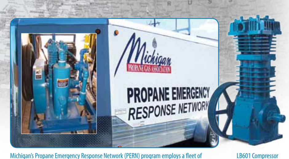
Michigan's Propane Emergency Response Network (PERN) program employs a fleet of emergency trailers that are equipped with Blackmer pumps and compressor units.

Headquartered in St. Petersburg, Russia, Lenoblgaz OAO (or, in English, Lenoblgas JSC) is the main supplier of LPG and natural gas to Russia's sprawling Northwestern Federal District.