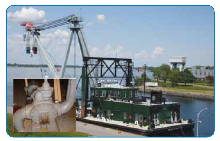
The same Blackmer GL6 Model Sliding Vane Pump has been used to pump bilge water on a barge in the St. Lawrence Seaway for more than 50 years.

construction began on the St. Lawrence Seaway, a series of canals that stretch from Montreal, Quebec, Canada, to Lake Erie and allows ships to travel from the Atlantic Ocean to the Great Lakes. As the Seaway was being built, the Saint Lawrence Seaway Development Corporation (SLSDC) commissioned the construction of the Grasse River, a derrick/crane barge that would be used as a "gatelifter" when the Seaway's locks needed to be maintained, repaired or replaced.