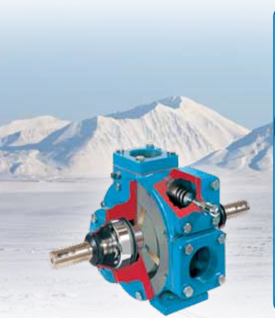
TX Series Pump

research on such topics as astrophysics, biology, geology, meteorites and weather. Needless to say, the extreme climate dictates that equipment breakdowns cannot be tolerated. With that in mind, the residents of one of these "ice stations" rely on Blackmer F210A Series Sliding Vane Hand Pumps to ensure that their fluid-transfer needs are met – no matter how low the temperature may go. They are reliably, and confidently, using the Backmer pumps to transfer AN8 and JP5 diesel fuel, Mogas aviation fuel and kerosene.